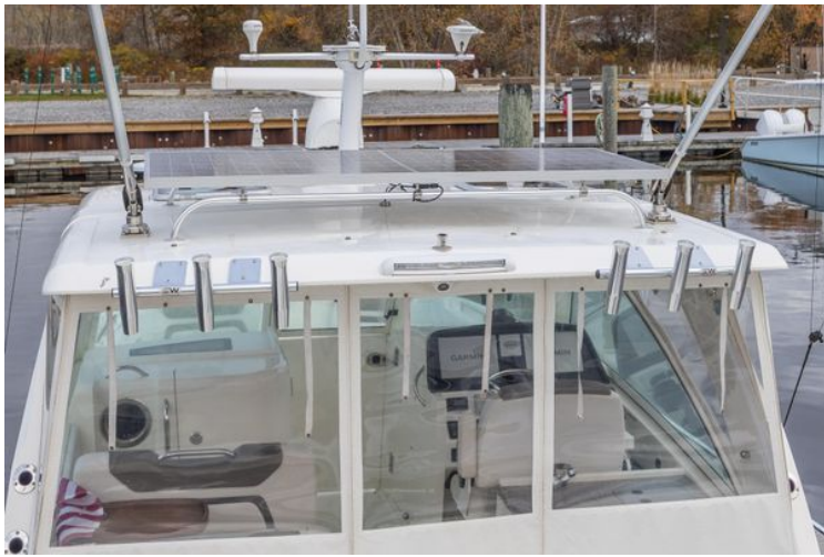
Radar, solar array, outriggers, rocket launchers