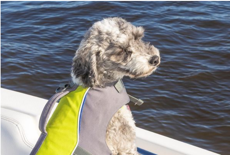
First Mate at Lookout