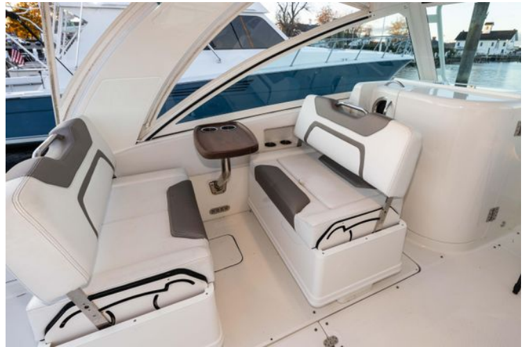
Port seating in dinette arrangement