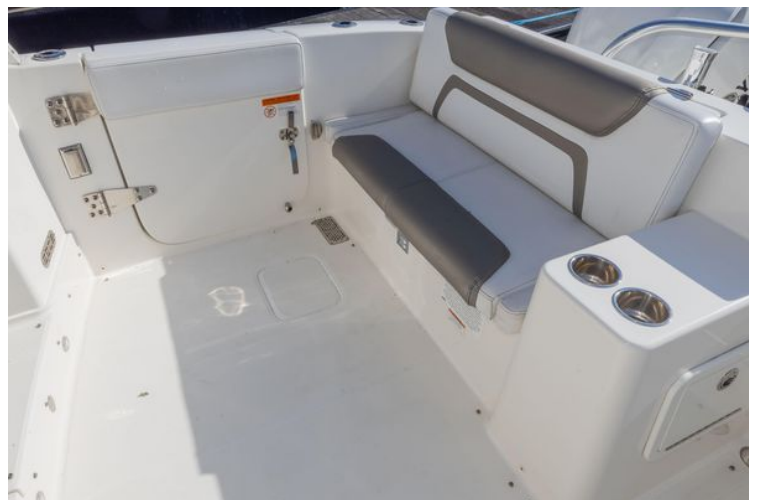
Starboard boarding gate