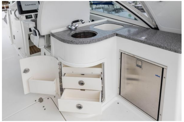
Galley with storage below