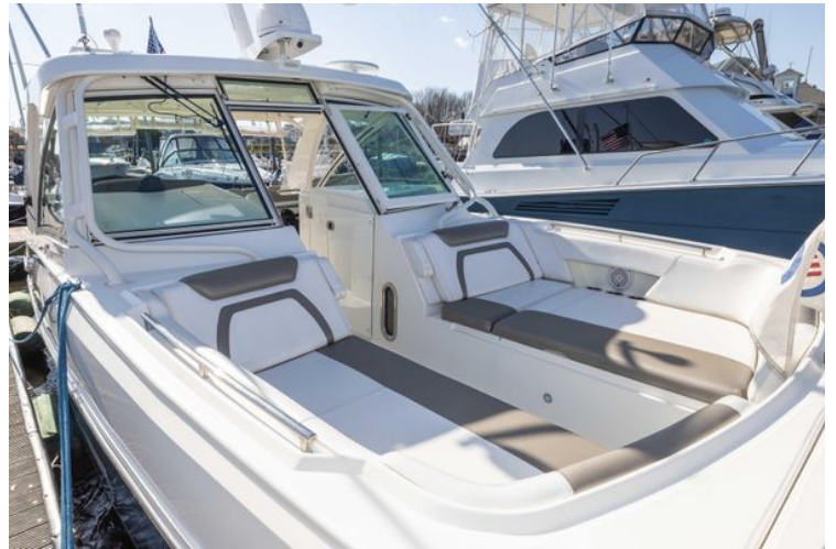
Another view of the bow