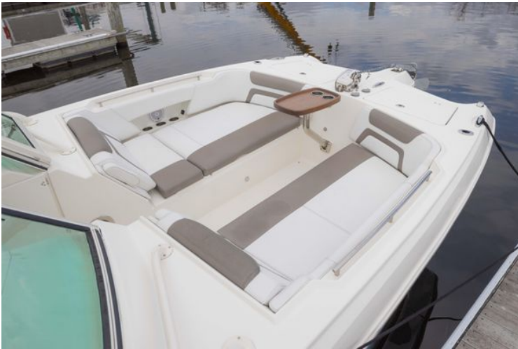
Elevated view of the bow, showing twin seats/sun beds and table