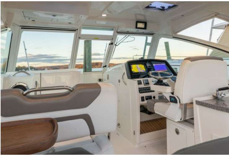
Comprehensively appointed helm station