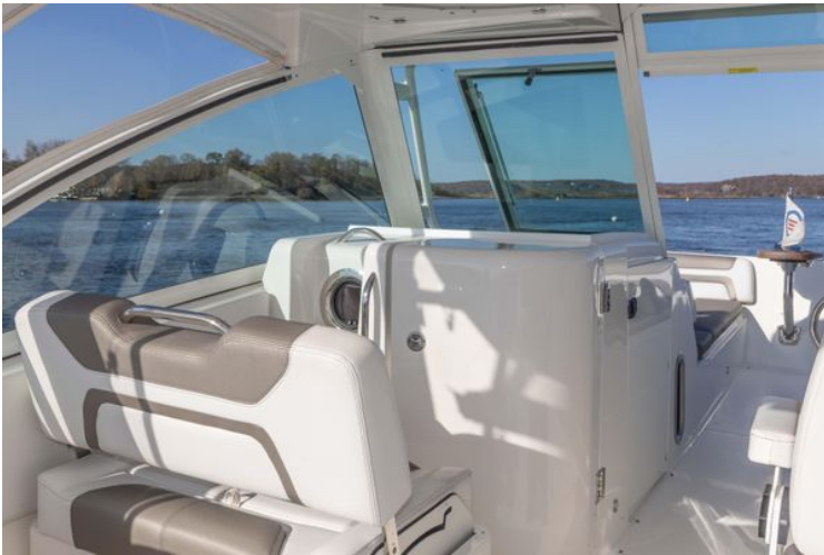
Port seating and nav station