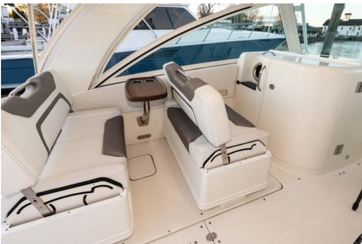
Port seating in forward facing arrangement