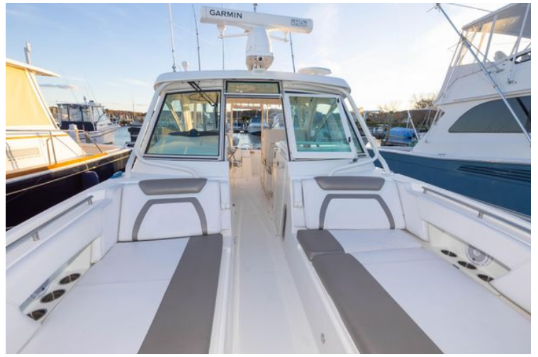
Looking aft from the bow, showing the seats/sun beds, and pilot house door open