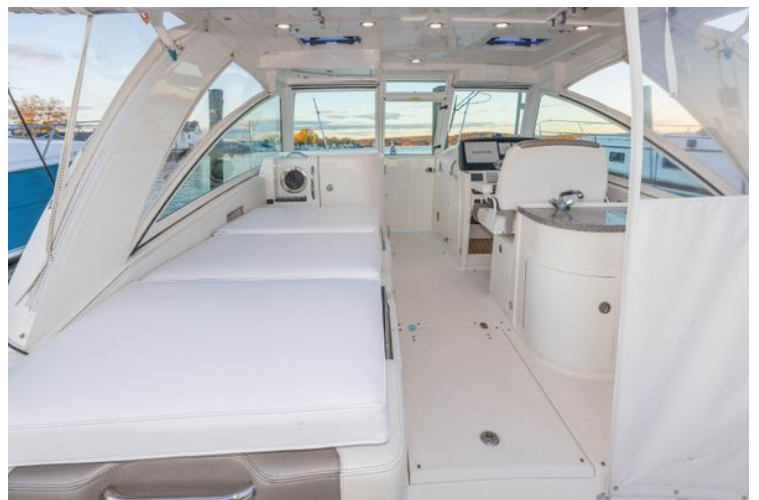
Port seating converted to a large berth