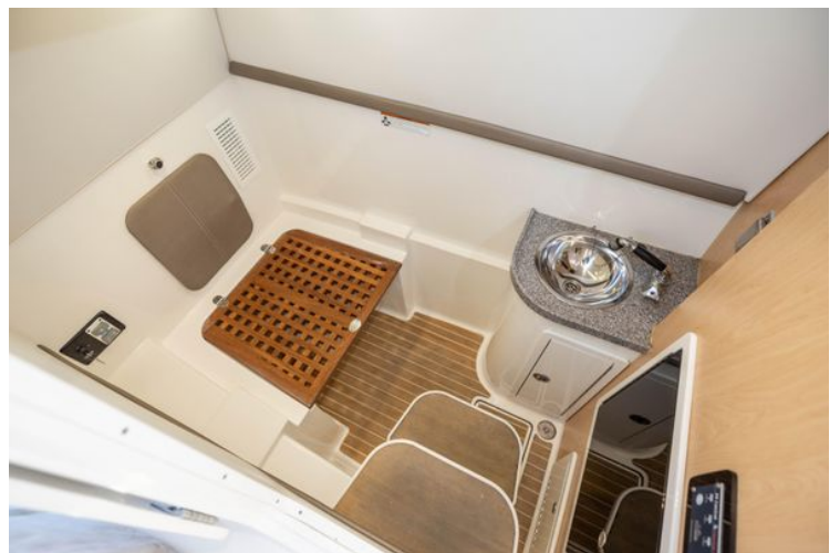
Spacious private head and shower with all amenities, with shower seat folded down