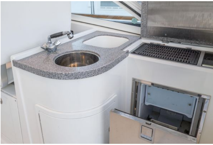
Sink, grill, and refrigerator