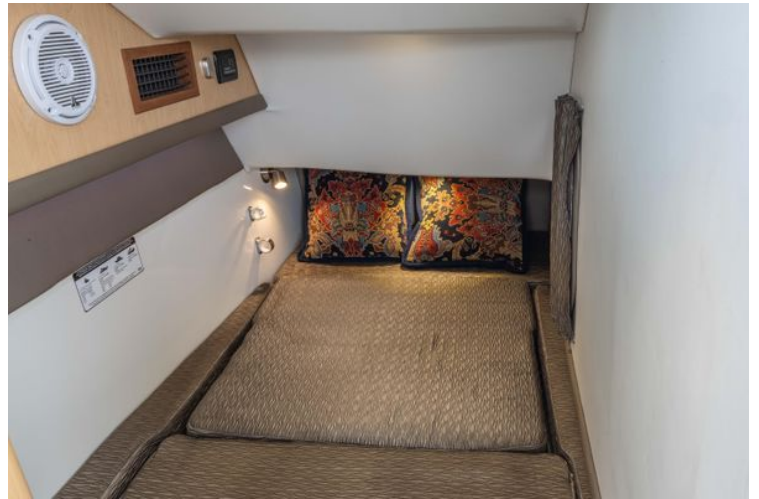
Port console in berth configuration