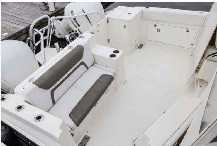
Elevated view of the aft cockpit