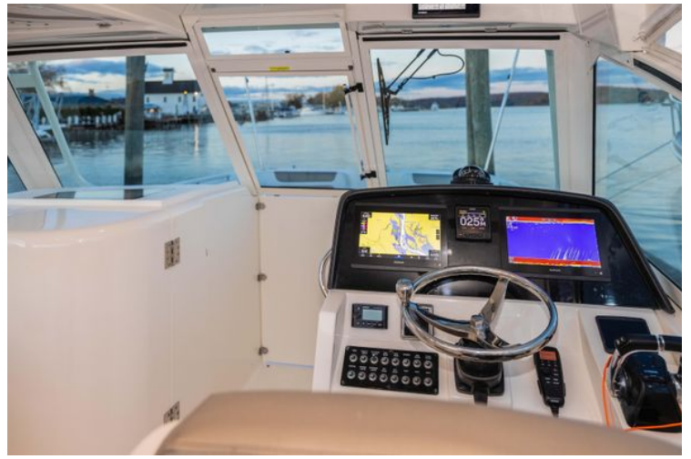
Instrument panel, with great 360 degree visibility