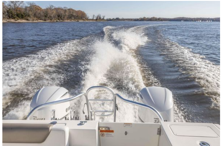
Wide open at 45 mph, cruise at 30-35.