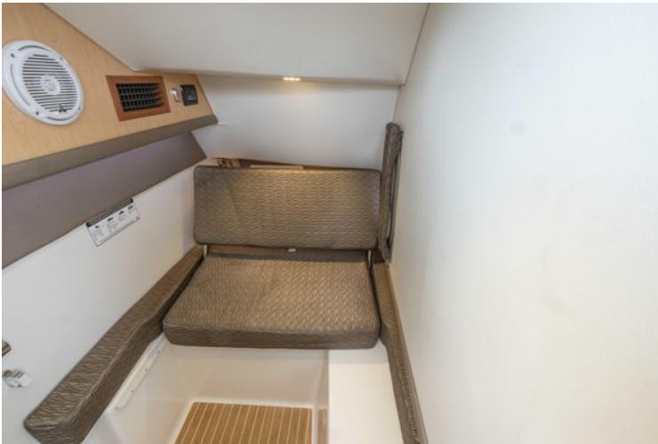
Port console in seat configuration