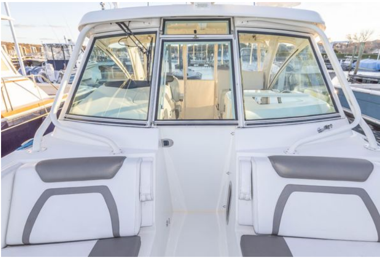
Looking aft from the bow, with the pilot house door closed