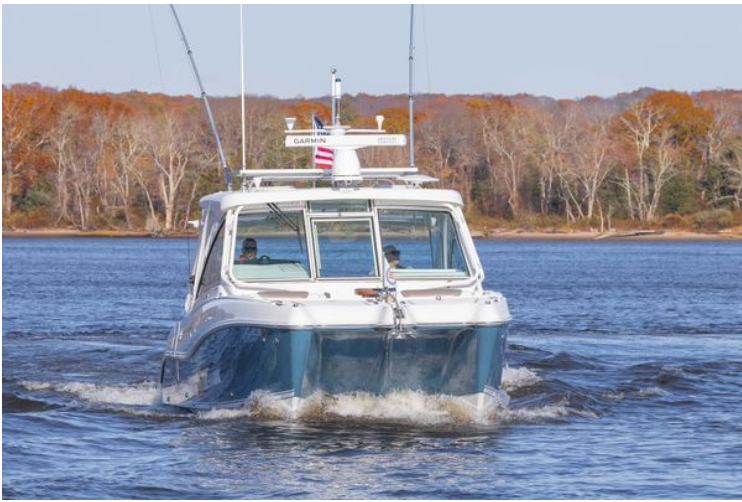
Head on view