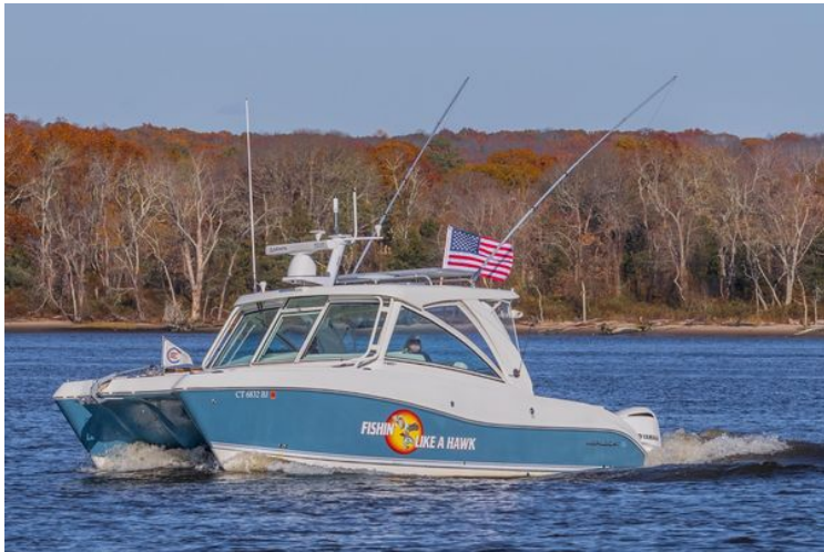
World Cat 320 DC