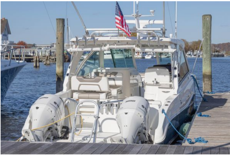
Twin Yamaha 300s, sturdy folding swim ladder